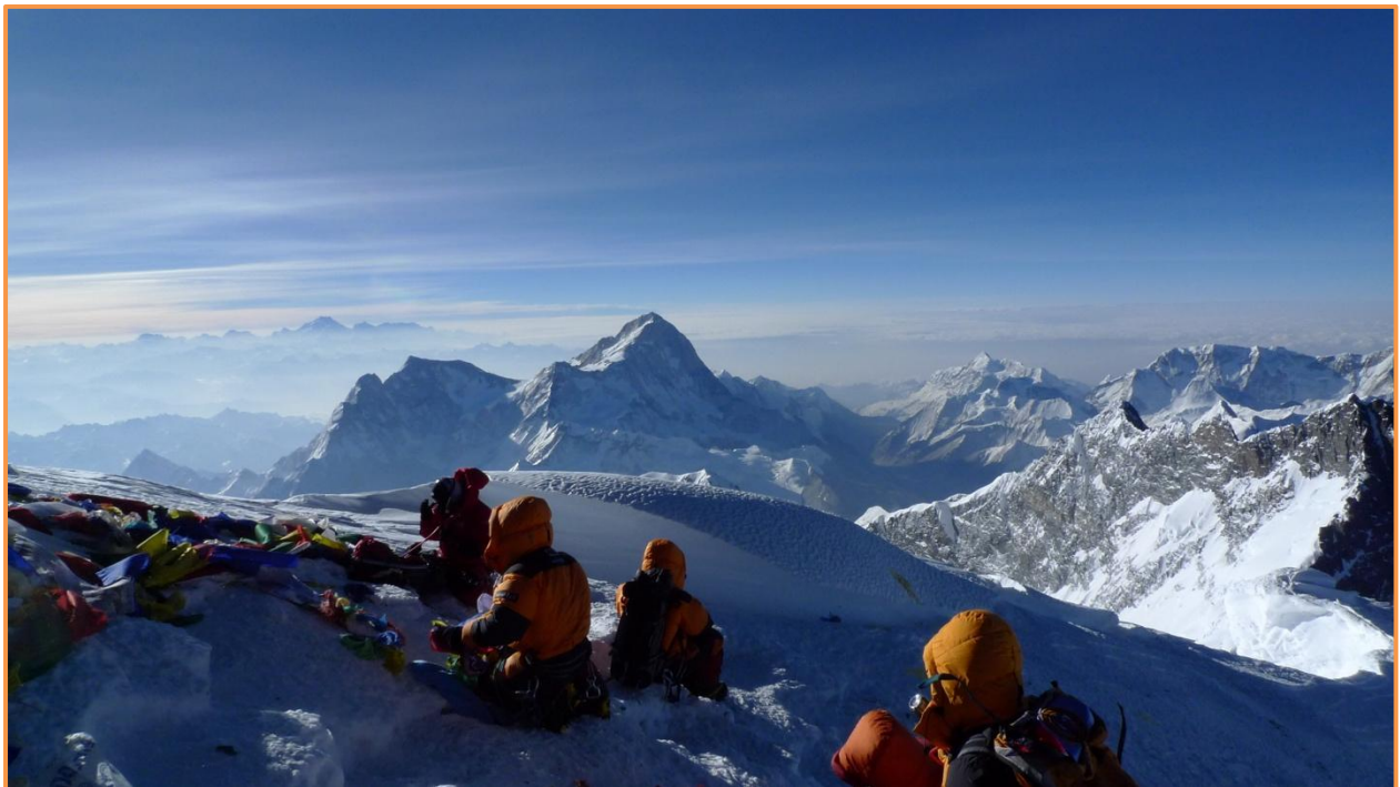
Sunrise from Everest summit at 8,400 m / 27,559 ft with Makalu in the background