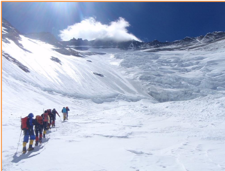
On the way to Camp 3 on the Lhotse face