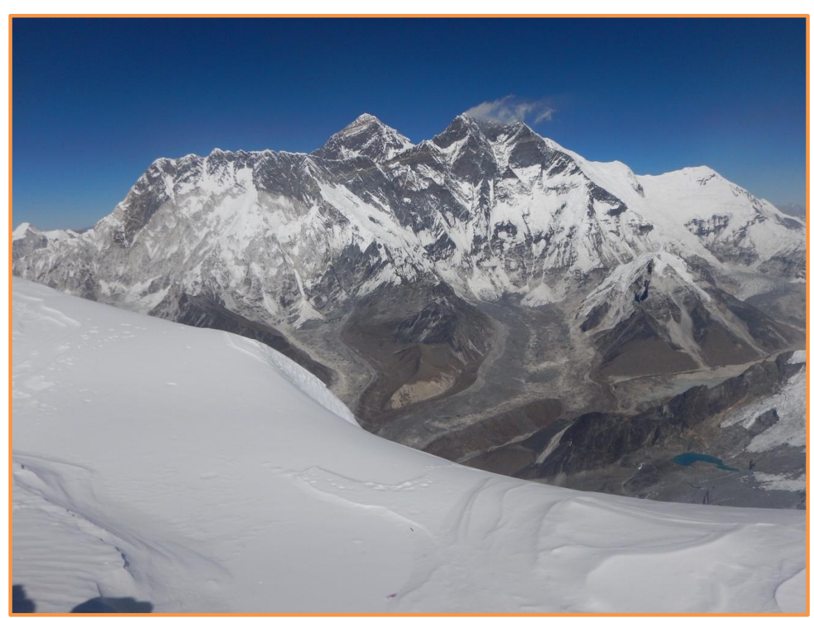
The view at the summit: Everest, Nuptse and Lhotse