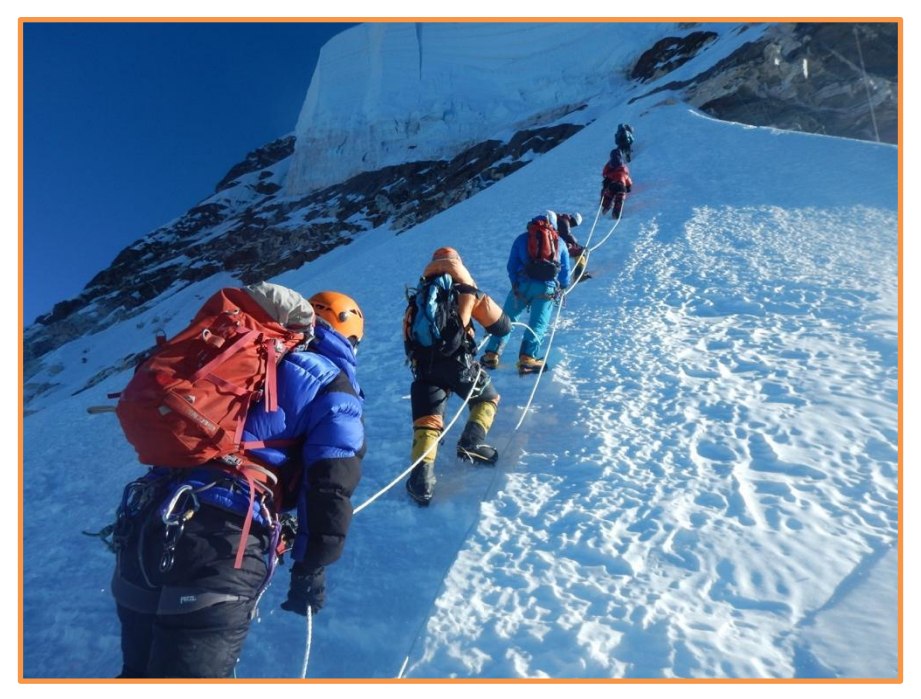
Beginning of the ice slope to the summit