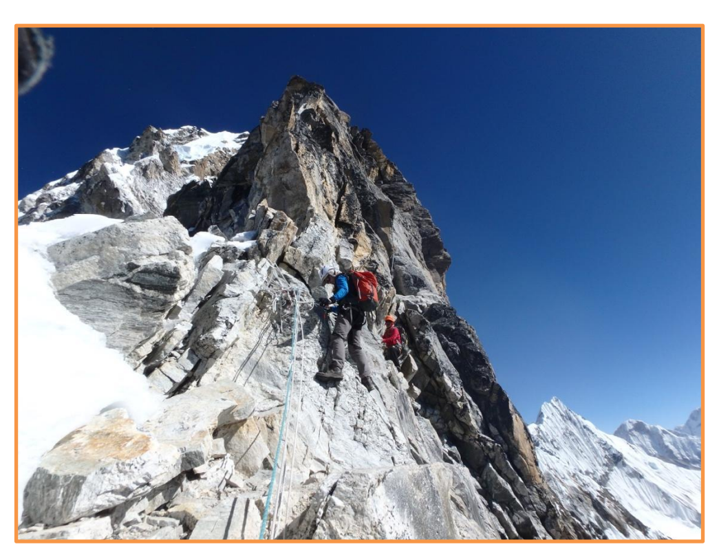
Climbing Yellow Tower towards Camp 2