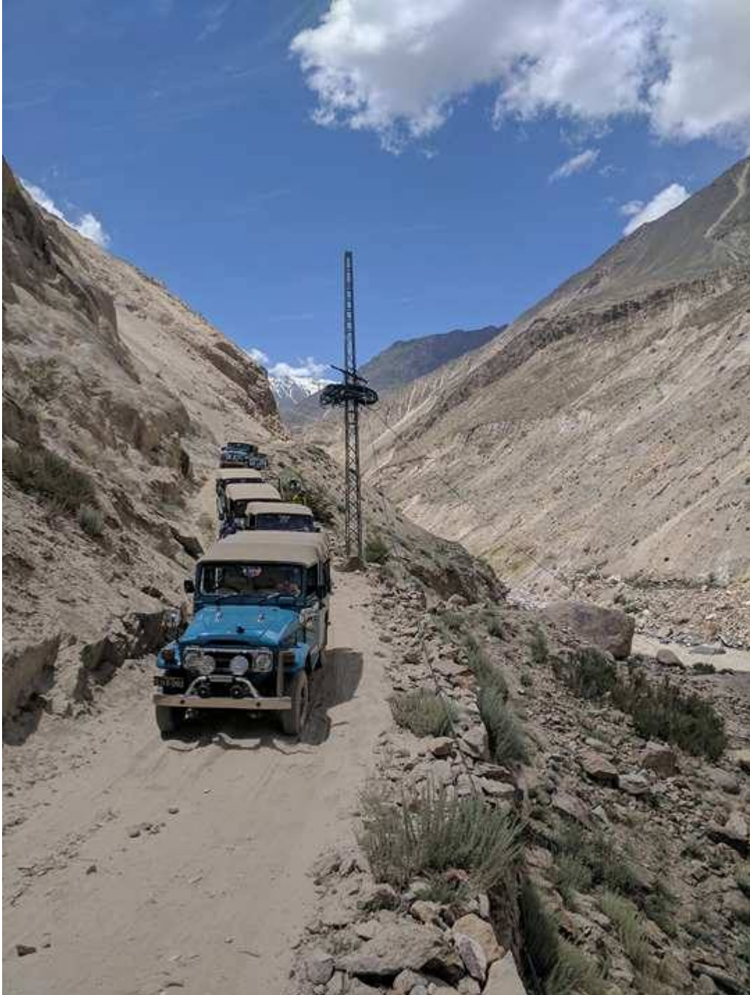
Traveling by jeep from Skardu to Askole