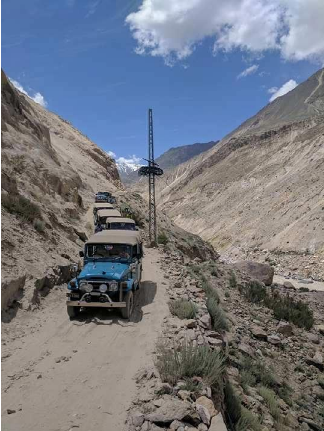
Traveling by jeep from Skardu to Askole