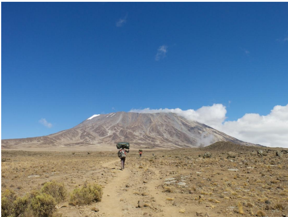
Between Mawenzi and Kibo Hut