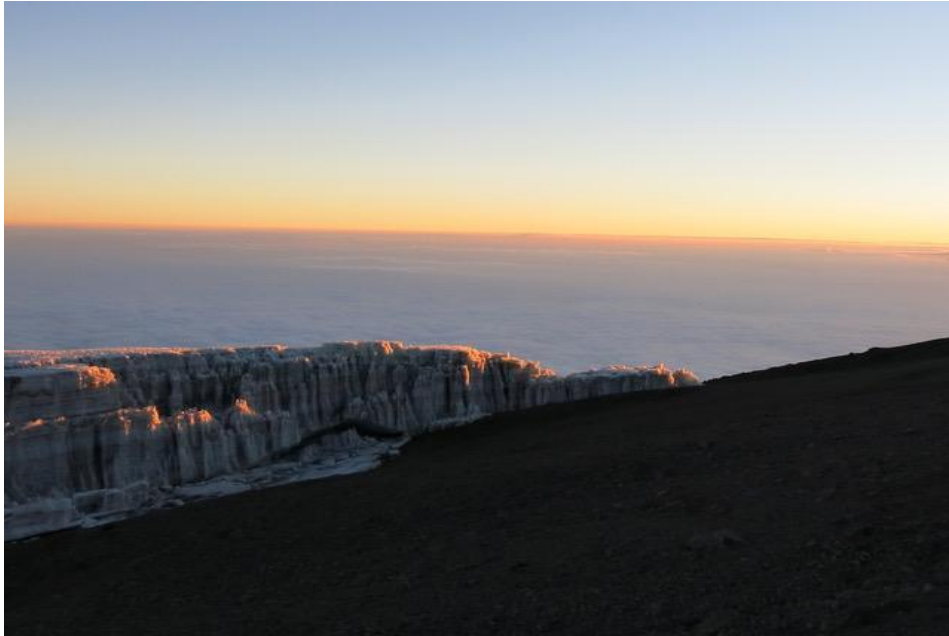
View of Glacier from the summit