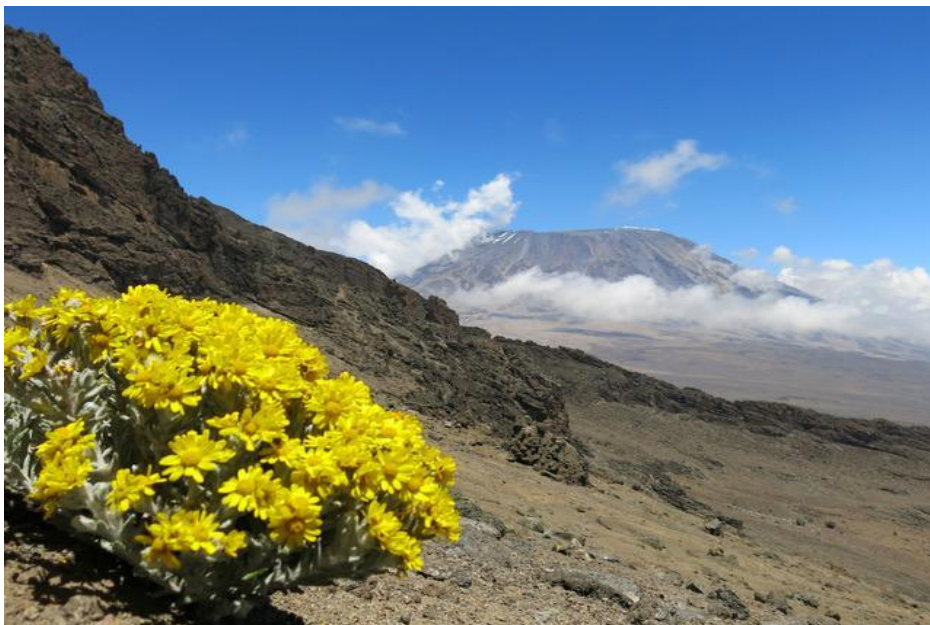
View from Mawenzi Peak