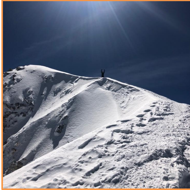
Orizaba summit ridge