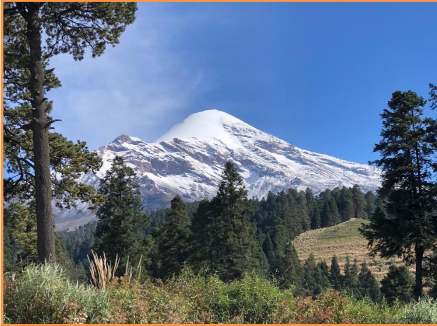
Pico de Orizaba – Highest mountain in Mexico and 3 rd highest in North America