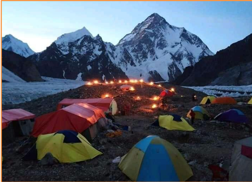
Camping on the Baltoro Glacier