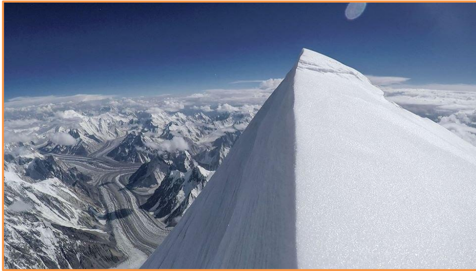
Summit of K2