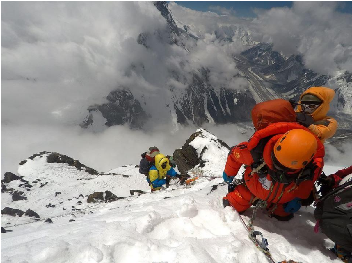
The top of the black pyramid