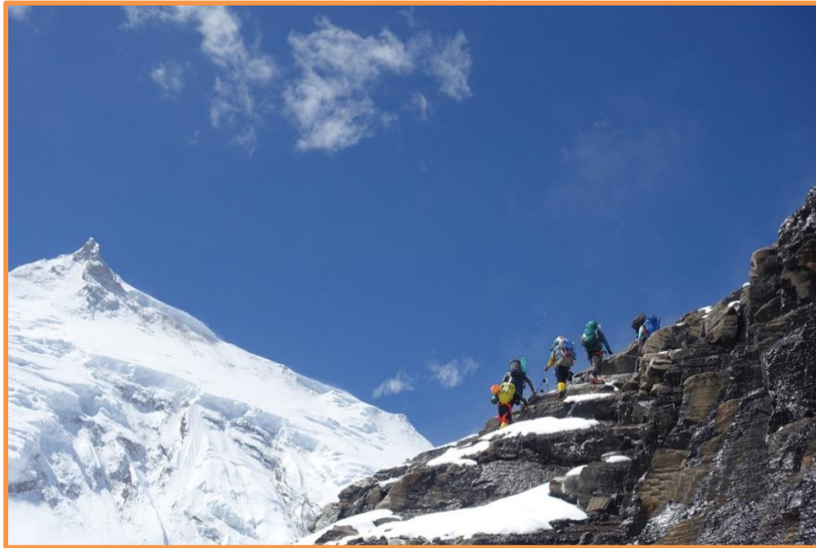
Manaslu from above Base Camp