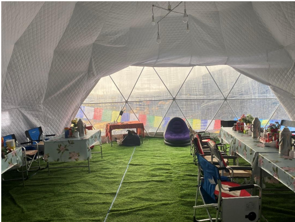
World Sherpas very cosy and comfortable Base Camp