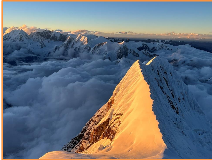
Looking down from Manaslu on way to Camp 4