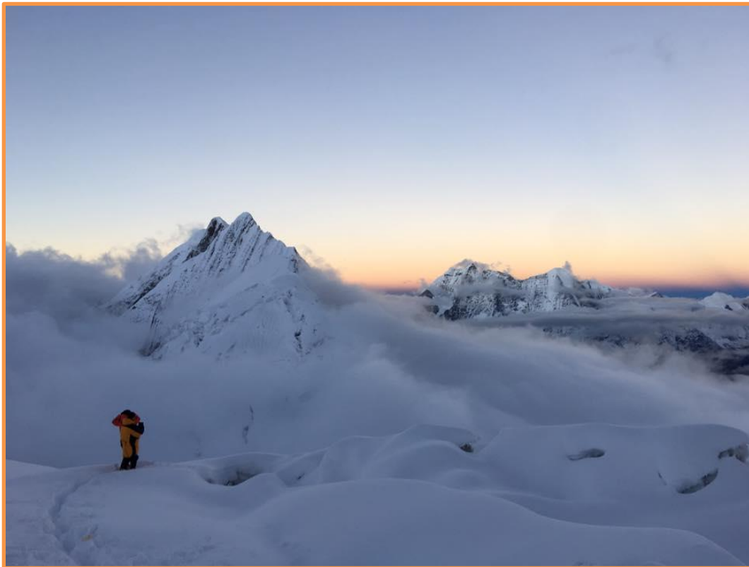
Near Camp 2 on Manaslu