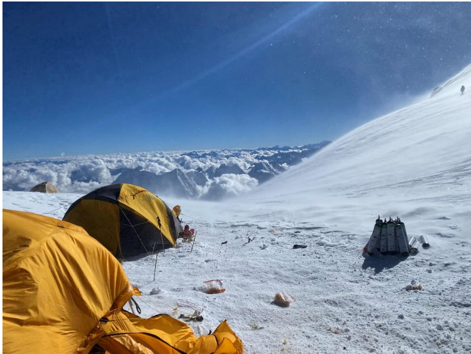
Manaslu Camp 4