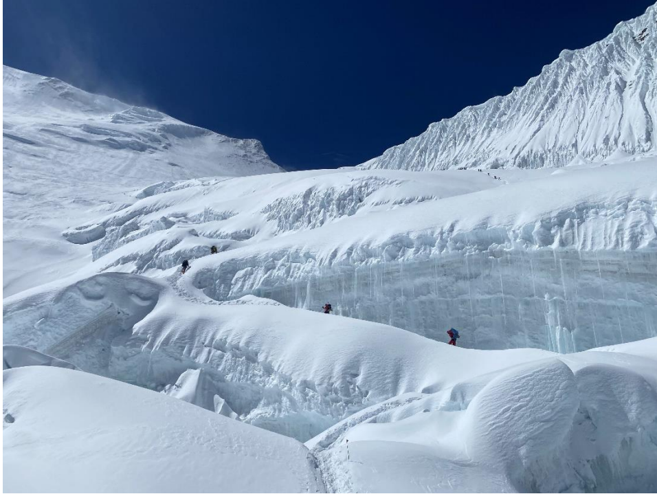
Climbing up towards Camp 3