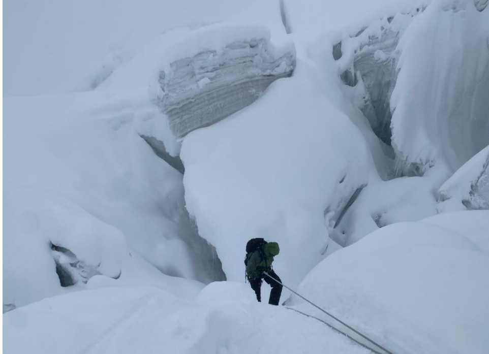
Climbing between Camp 1 and Camp 2