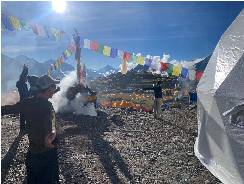
Manaslu Base Camp